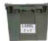
Label Holders / Placards