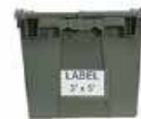
Label Holders / Placards